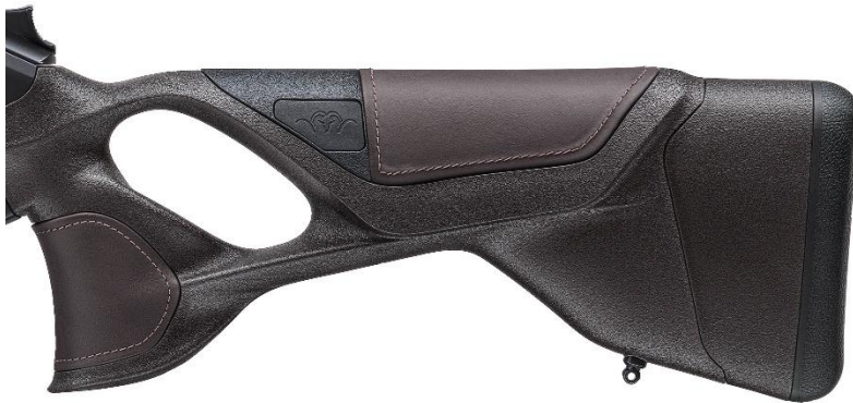
R8 Ultimate stock with adjustable comb

The multi-level adjustable comb, which is operated intuitively and without tools – thanks to the memory function – ensures the perfect mounting in every situation. With this system, the comb can be fitted to individual body proportions or different optics within seconds.