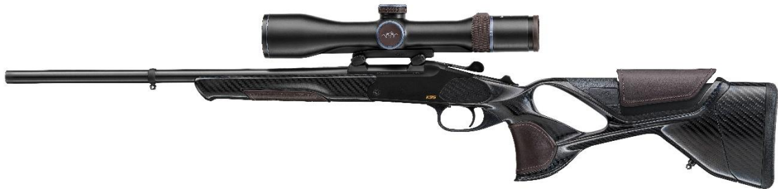
K95 Ultimate Carbon, adjustable comb with Blaser riflescope 2.8-20x50 iC

The K95 Ultimate Carbon combines tradition and technology in a unique way. The two-piece ergonomically designed thumbhole stock ensures a completely relaxed hand position, as well as optimal control for accurate shooting. The Carbon fiber offers an astoundingly high strength at an extremely low weight – this makes the K95 Ultimate the best choice when stalking long distances through impassable terrain. Like the R8 Ultimate the K95 Ultimate can be tailored to the exact needs of the shooter – due to the newly developed modular stock options such as adjustable comb, recoil absorption system and adjustable recoil pad. These are identical for both rifles.