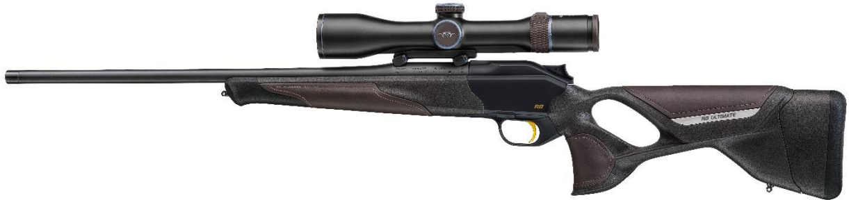
R8 Ultimate Leather with Blaser riflescope 2.8-20x50 iC