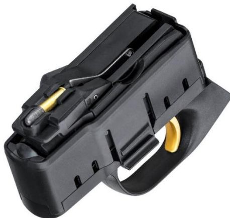
Magazine insert for the .22 lr