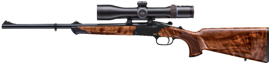
K95 with Blaser riflescope 2.8-20x50 iC

Elegant, huntable, accurate – for decades the Blaser K95 single-shot rifle has proven itself in demanding hunting situations. With a newly designed stock and receiver the tradition of the single-shot rifle will continue into the future.