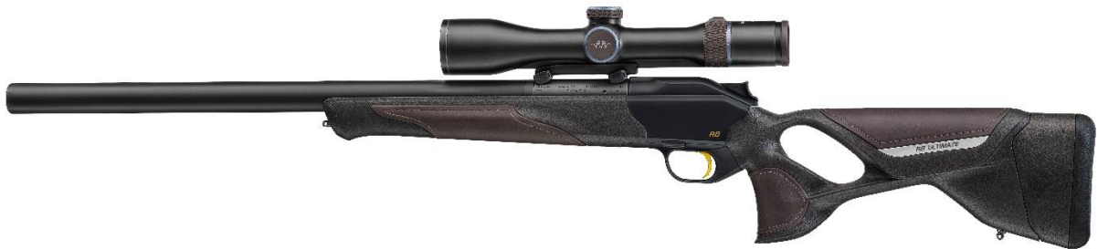
R8 Ultimate Silence Leather with Blaser riflescope 2.8-20x50 iC

The R8 Ultimate sets a new standard in terms of functionality and design. The two-piece thumbhole stock ensures a completely relaxed shooting position, as well as optimal control of the rifle when firing. With the newly developed, modular stock options, the R8 Ultimate and the R8 Ultimate Silence are exactly tailored to your individual needs. All of these options support our goal to provide what is needed to shoot better in every situation.