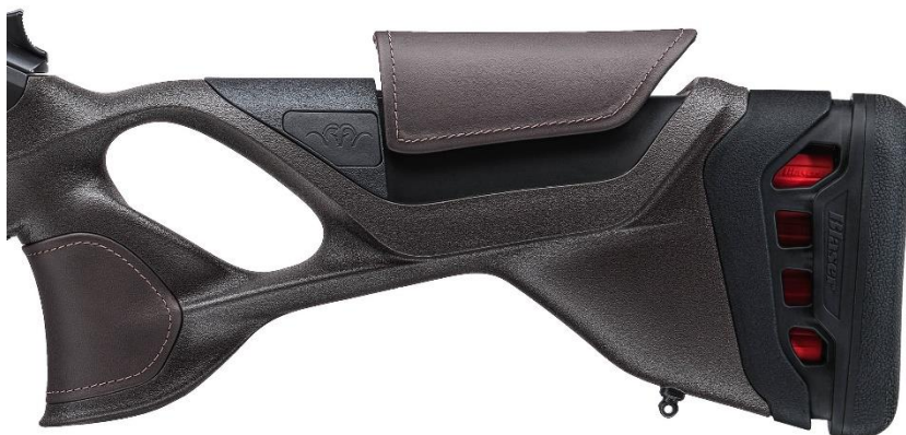
R8 Ultimate stock with adjustable comb and recoil absorption system

The quick and easily inserted recoil pad with recoil absorption system makes for a pleasant shooting experience – even with larger calibers. The internal absorption elements are available in different hardness, which can be adjusted to your preferences and produce a noticeably reduced muzzle climb while shooting. The recoil absorption system, especially in combination with the R8 Ultimate Silence or another silencer option, offers unmatched comfort while shooting.